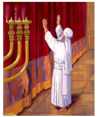
The old has gone.

Hebrews makes clear that Jesus Christ exceeds all other people, pursuits, objects, or hopes to which human beings offer allegiance. It pictures Jesus as better than the angels; as bringing better life to humanity through salvation; as offering a better hope than the Mosaic Law could promise; as a better sacrifice for our sins than used to be achieved by sacrificing a bull or a goat; and as providing a better inheritance in heaven for those who place their faith in Him (1:4; 6:9; 7:19; 9:23; 10:34). Jesus is superior to all others.